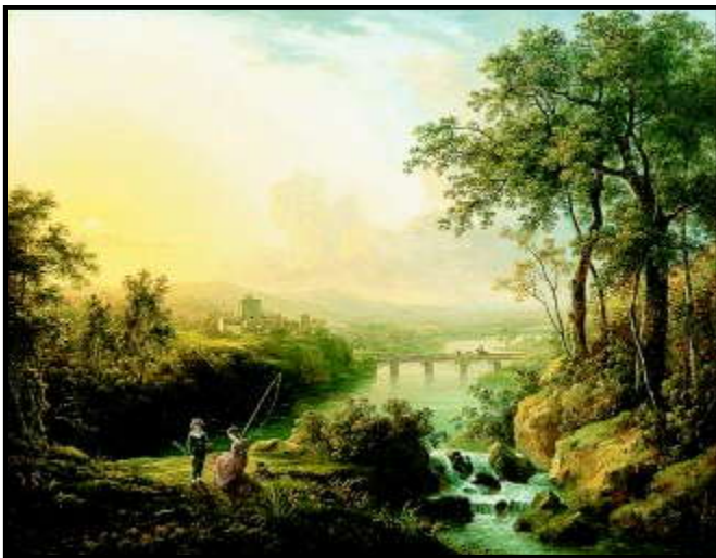
River Landscape with Children Fishing 19th century painting by Abraham Pether

OUR NEXT MEETING WILL BE ON December 26th